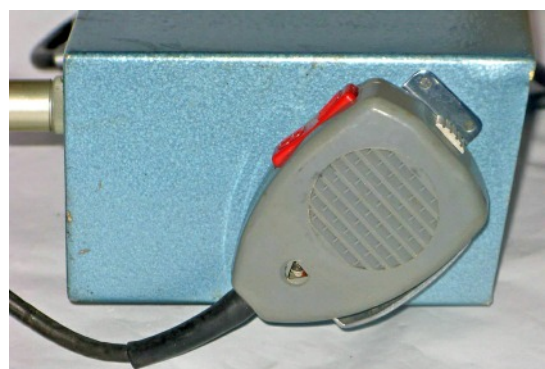
Left hand side view with speaker/microphone.